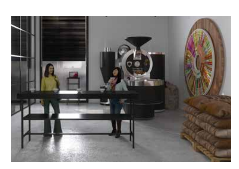
Insights on the future of coffee and beverages.